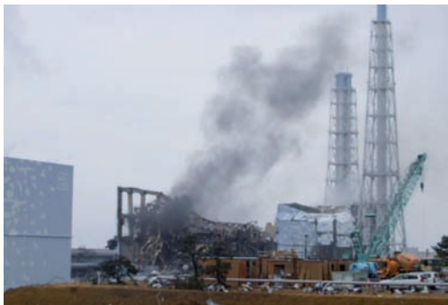
The smoking No.3 reactor building and the damaged No. 4 reactor building of the quake-hit Fukushima Daiichi Nuclear Power Station on March 15, 2011

The build-up of such fission products in the fuel, though, is what eventually necessitates pulling fuel elements out of the reactor for recycling. In the pyroprocessing system – a type of electro-refining common in the metallurgical industry but unique to the IFR among reactor systems - the majority of the fission products are isolated. The rest of the fuel is reincorporated into new fuel elements. The fission products, representing only a small percentage of the fuel, are entombed in borosilicate glass that cannot leach any of them into the environment for thousands of years. Yet the fission products will only be radioactive beyond the level of natural ore for a few hundred years (see Figure 2). Therefore the socalled "million-year waste problem" is neatly